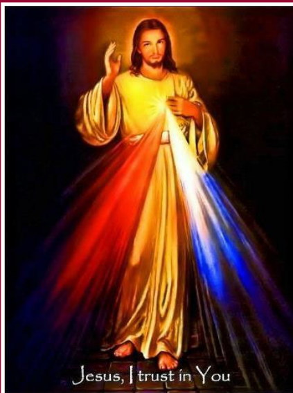
Jesus ~ Divine Mercy

Have you seen our framed image of Divine Mercy normally located in the Blessed Sacrament Chapel? It is moved and displayed in the front center aisle each morning when the Divine Mercy Chaplet is prayed here at Our Lady of Mount Carmel. The image is a depiction of Jesus based on the devotion initiated by Saint Faustina Kowalska (canonized by Saint John Paul II in 2000). Jesus is shown raising his right hand in blessing, and pointing with his left hand to his chest from which flow forth two translucent rays: one red and one white. The depiction contains the message "Jesus, I trust in