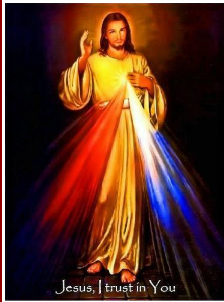
Jesus ~ Divine Mercy

Divine Mercy Sunday is celebrated on the Octave Day of Easter, the Sunday after Easter. The feast of Divine Mercy, as recorded in the diary of Polish Saint Faustina Kowalska, receives from Jesus himself the biggest promises of grace related to the Devotion of Divine Mercy. In specific, Jesus said that a person who goes to sacramental Confession (the confession may take place some days before) and receives Holy Communion on that day, shall obtain the total forgiveness of all sins and punishment. That means each person would go immediately after death to heaven without suffering in purgatory (or hell).