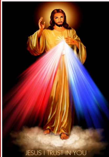
Jesus ~ Divine Mercy

Divine Mercy Sunday is celebrated on the Octave Day of Easter, the Sunday following Easter. The feast of Divine Mercy, as recorded in the diary of Polish Saint Sister Faustina Kowalska, (canonized by Saint John Paul II in 2000—the first saint canonized in the new millennium), receives from Jesus himself the biggest promises of grace related to the Devotion of Divine Mercy. In specific, Jesus said that a person who goes to sacramental Confession (the confession may take place some days before) and receives Holy Communion on that day, shall obtain the total forgiveness of all sins and punishment. That means