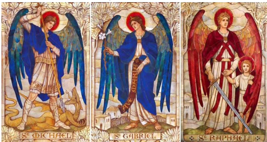
St. Michael, St. Gabriel, and St. Rafael Feast Day: Thursday, September 29

TWENTY-SIXTH SUNDAY IN ORDINARY TIME September 25, 2016